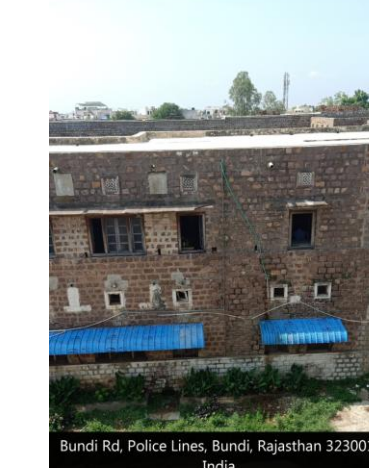
Bundi Rd, Police Lines, Bundi, Rajasthan 323001, India Latitude 25.4320366666666 Longitude 75.64967° 65° Local 10:10:29 AM Altitude 273.6 meters GMT 04:40:29 AM Tuesday, 13-07-2021