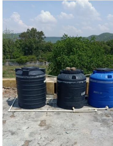
Unnamed Road, Police Lines, Bundi, Rajasthan 323001, India Latitude 25.432036° Longitude 75.650832° Local 10:51:41 AM Altitude 214.8 meters GMT 05:21:41 AM Wednesday, 14-07-2021