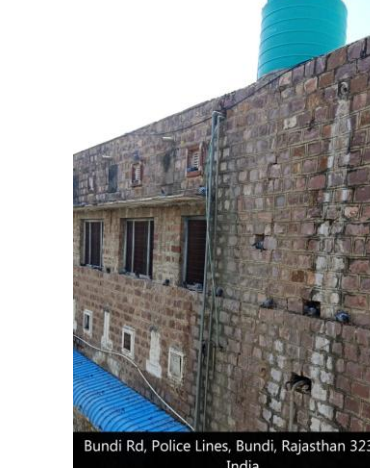
Bundi Rd, Police Lines, Bundi, Rajasthan 323001, India Latitude 25.4318850000000 Longitude 75.6495566666667 05° Local 10:49:29 AM Altitude 276.7 meters GMT 05:19:29 AM Wednesday, 14-07-2021