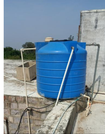
Devpura road, Police Lines, Bundi, Rajasthan 323001, India Latitude 25.4317816666666 Longitude 75.6496449999999 66° Local 10:05:37 AM Altitude 274.5 meters GMT 04:35:37 AM Tuesday, 13-07-2021