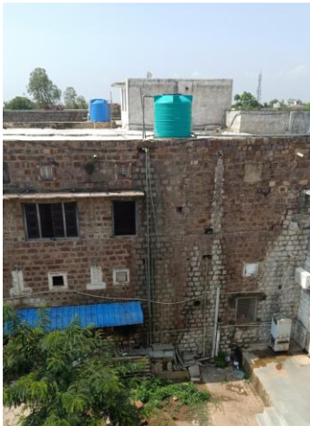
Bundi Rd, Police Lines, Bundi, Rajasthan 323001, India Latitude 25.432025° Longitude 75.649565° Local 10:10:49 AM Altitude 273.5 meters GMT 04:40:49 AM Tuesday, 13-07-2021