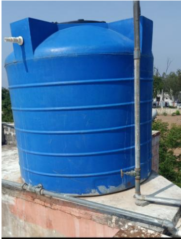
Naru Ki Bawari, Kagadi Devra, Police Lines, Bundi, Rajasthan 323001, India Latitude 25.4320866666666 Longitude 75.6494666666667 7° Local 10:03:57 AM Altitude 272.3 meters GMT 04:33:57 AM Tuesday, 13-07-2021