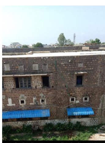
Bundi Rd, Police Lines, Bundi, Rajasthan 323001, India Latitude 25.4320366666666 Longitude 75.64967° 65° Local 10:10:28 AM Altitude 273.6 meters GMT 04:40:28 AM Tuesday, 13-07-2021