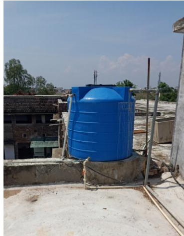
Bundi Rd, Police Lines, Bundi, Rajasthan 323001, India Latitude 25.4318816666666 Longitude 75.6495133333333 62° Local 10:53:27 AM Altitude 275.7 meters GMT 05:23:27 AM Wednesday, 14-07-2021