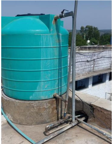
Bundi Rd, Police Lines, Bundi, Rajasthan 323001, India Latitude 25.4318716666666 Longitude 75.6495933333333 66° Local 10:05:17 AM Altitude 275.7 meters GMT 04:35:17 AM Tuesday, 13-07-2021