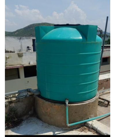
Bundi Rd, Police Lines, Bundi, Rajasthan 323001, India Latitude 25.4318700000000 Longitude 75.6495516666667 04° Local 10:53:05 AM Altitude 275.1 meters GMT 05:23:05 AM Wednesday, 14-07-2021